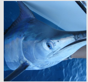
Recent trip to Exmouth, 70-80 Kg (approx.) Marlin at the boat. Only a baby, but what a thrill

We have organized the breakfast on the day to be handled by the Special Olympics Association.